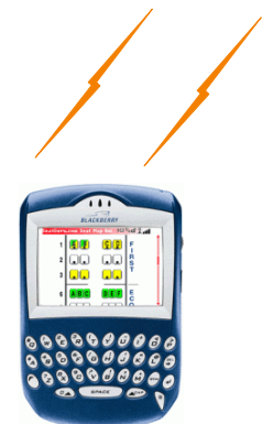
Blackberry „Digital World“