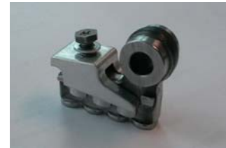
New Fittings (4x3 lips)

The 1 cm seat rail offers the following advantages over the conventional 1" rail: